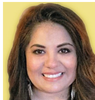
Site Manager (559) 528-2846