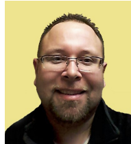
Intake Coordinator Data Assessor (650) 244-0305